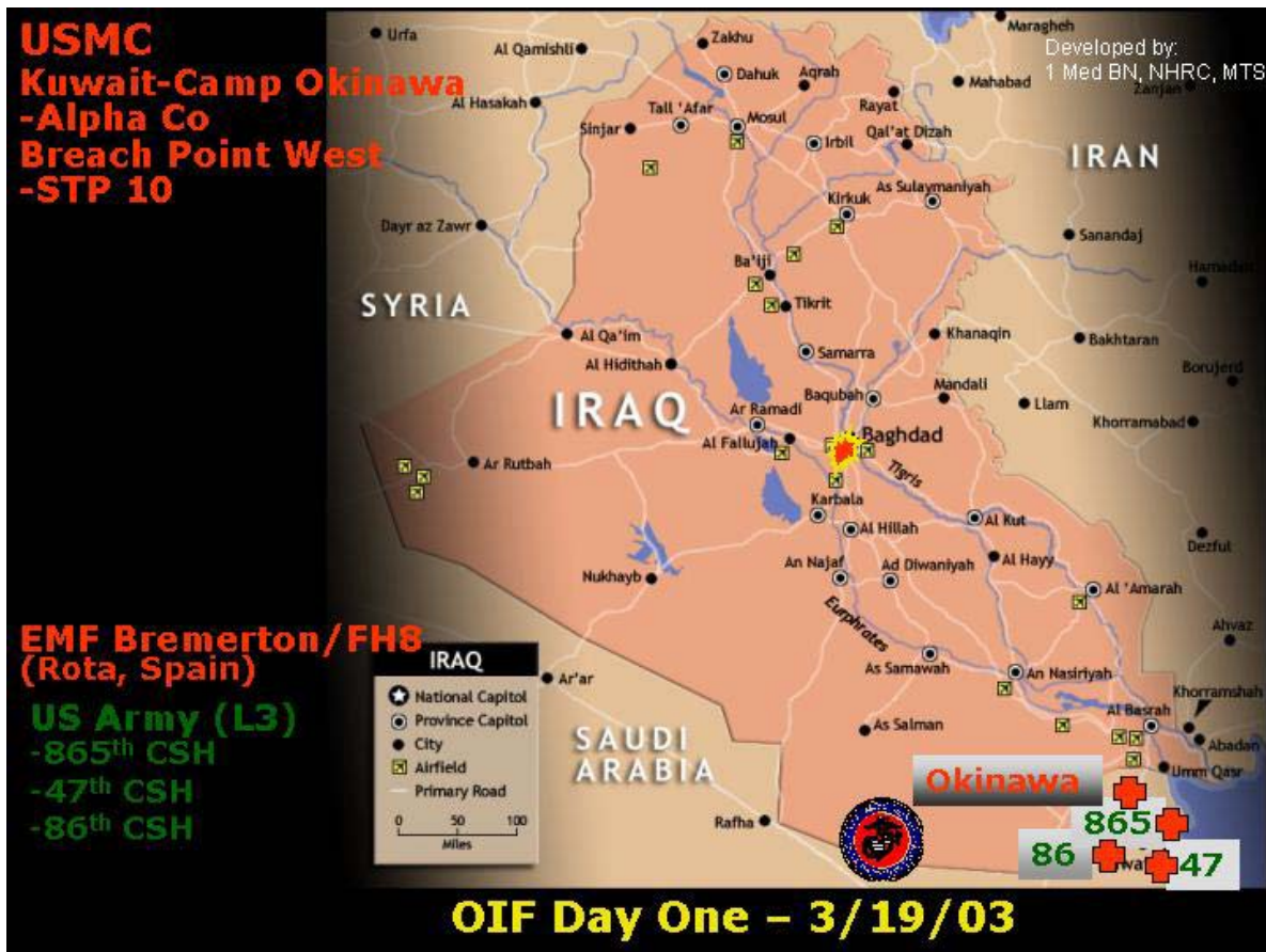
Figure 2: Navy-Marine Corps Medical Theater Laydown on Day 1 of the official combat period.

Corps MTFs operational were EMF-Bremerton (Fleet Hospital 8, Rota, Spain) Alpha Surgical Company in Kuwait and STP -10 near the border at Breach Point West.