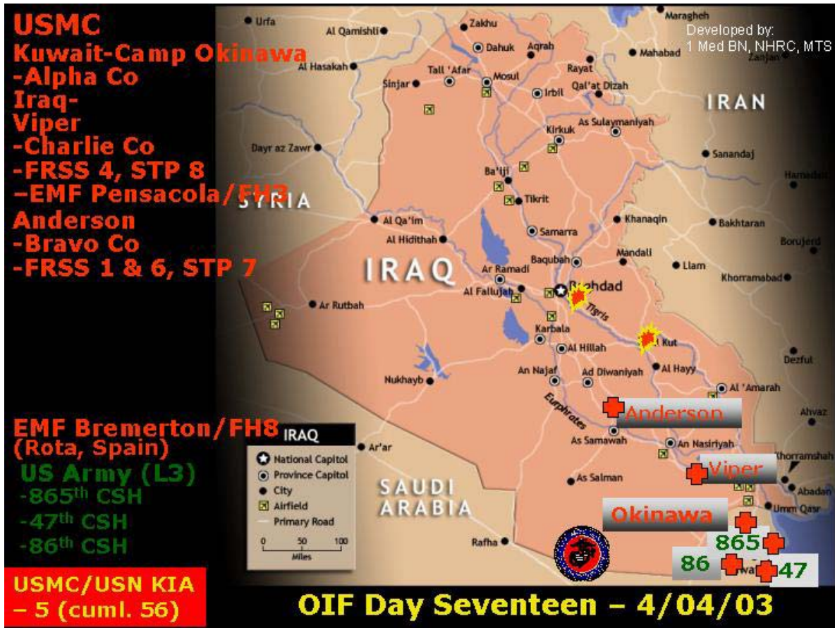
Figure 3: Navy-Marine Corps Medical Theater Laydown on Day 17 of the official combat period.

On the final day of the official combat period (day 27) the full compliment of Navy-Marine Corps MTFs were operational and operating in the positions designated in Figure 4. This compliment of MTFs included two EMFs, three surgical companies, six FRSSs, and the four STPs operating with Health Services Battalion.