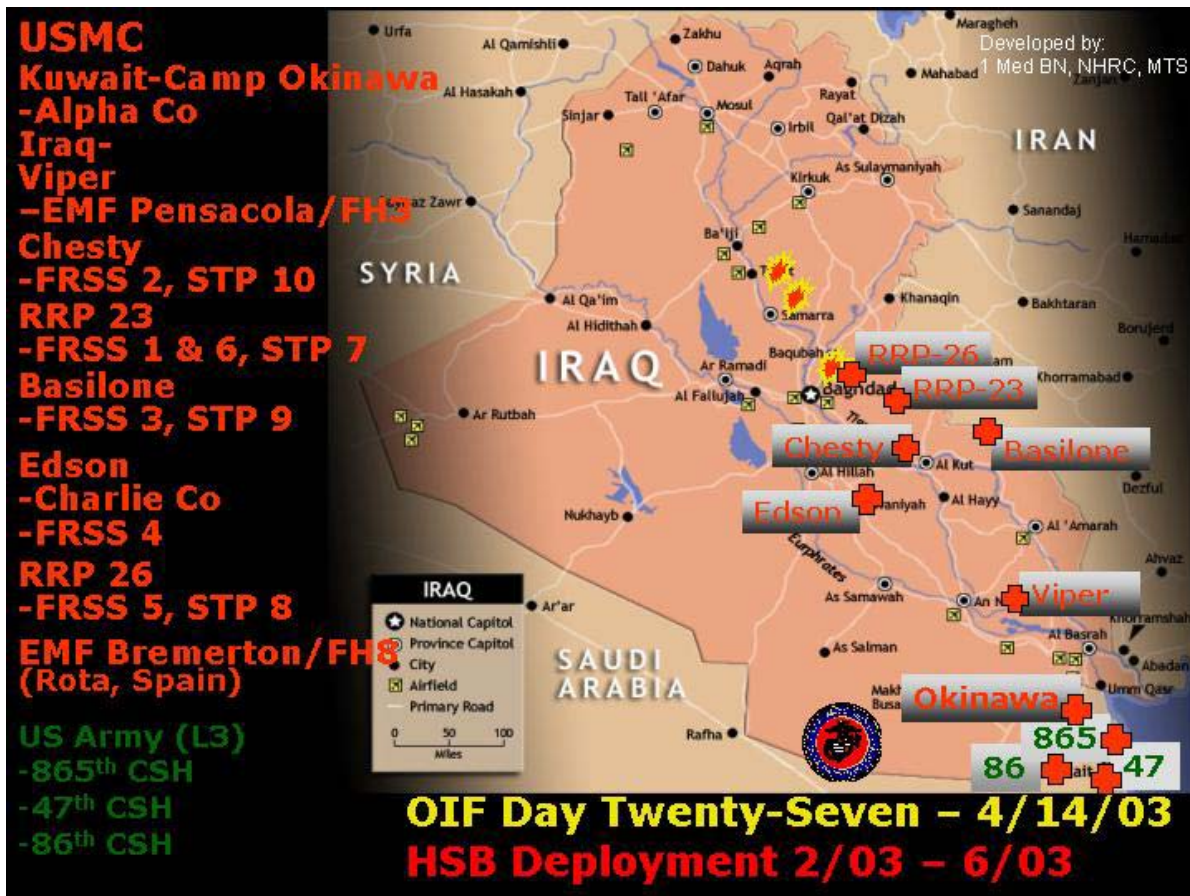
Figure 4: Navy-Marine Corps Medical Theater Laydown on Day 27 of the official combat period.